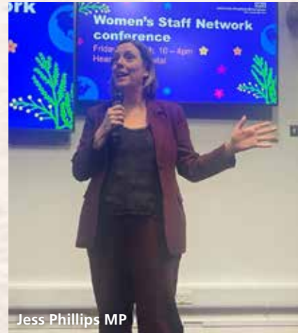
Jess Phillips MP

The Women's Staff Network is open to all staff and meetings take place on Zoom. Please email WomensNetwork@uhb.nhs.uk for dates and the link.